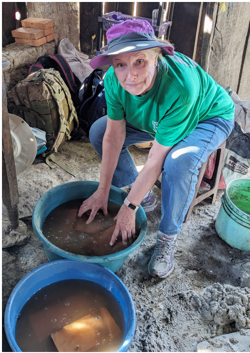
GUATEMALA from Page 1

The women who received stoves were so grateful and many were in tears because "God had answered their prayers". The entire family knew their lives would be healthier now and there would be fewer burns from fires on the ground.