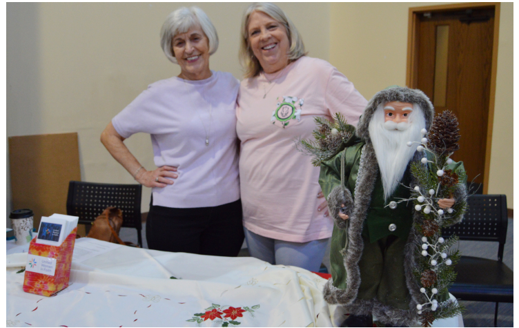
Christmas Coffeehouse 2024