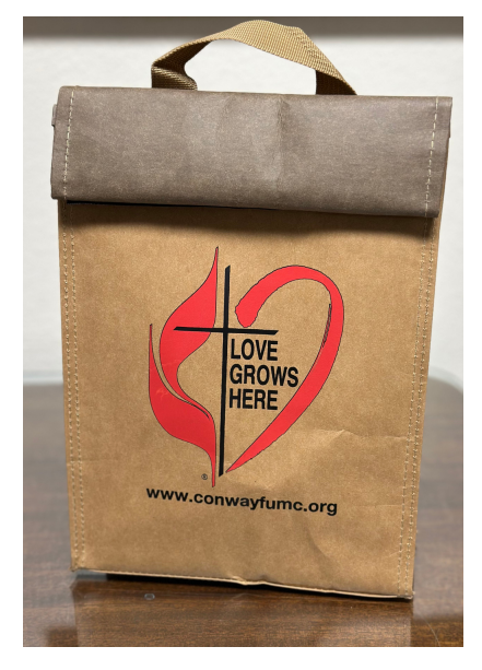
Welcome bags for new visitors

If you are thinking, "the Lunch Bags are so cool! I need one of those!", you're in luck. If you would like to buy one to help fund our hospitality ministry, they are $15. Each bag funds a donation to <a href="water.org">water.org</a> so that more people have clean and safe drinking water. The insulated brown bag is inspired by our passion for food missions and is reusable, recyclable, and made with sustainable materials inspired by the work of our United Women in Faith!