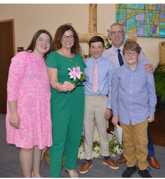
He is Risen! Easter at FUMC