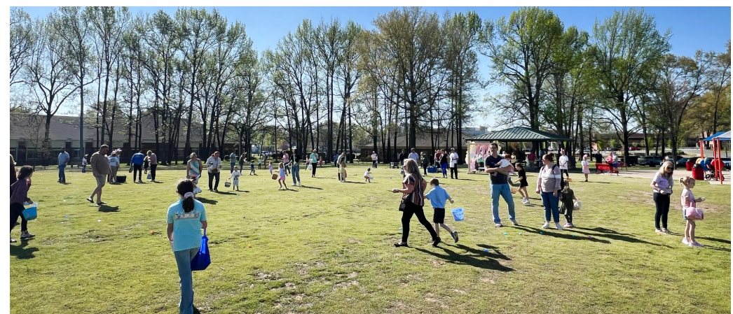
Children and adults alike enjoyed our annual Easter egg hunt, held March 29 at Laurel Park.