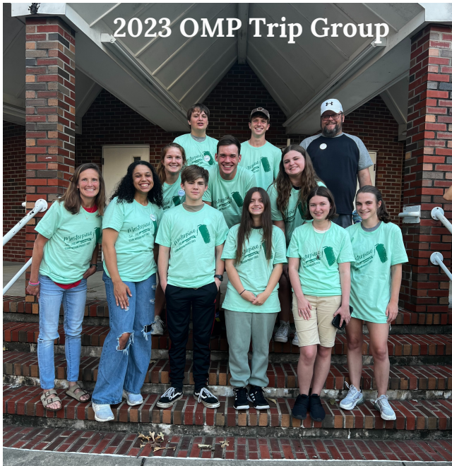
2023 OMP Trip Group

College students and young adults associated with the UCA Wesley and others from around the state gathered this past weekend at Mount Eagle Retreat Center for Respite -- a time of rest and renewal before the new semester starts.